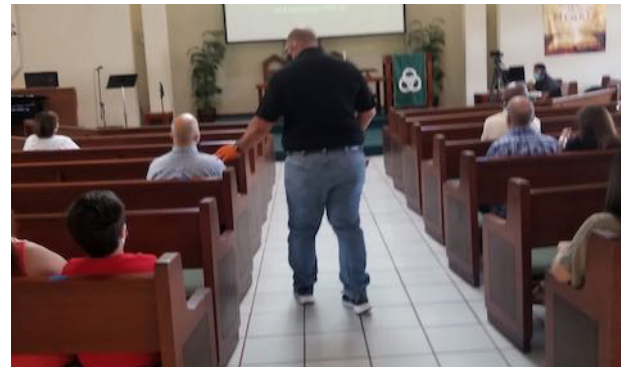
Ensuring social distancing and checking for proper use of masks