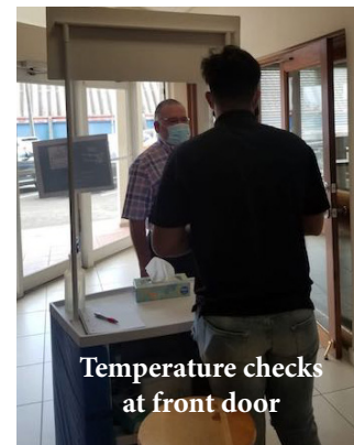
Temperature checks at front door