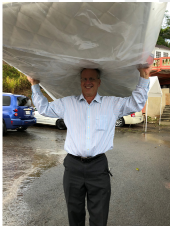
Juncos: Special Sunday delivery!