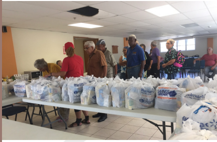
Providing food and water to a home for the elderly in Caguas.