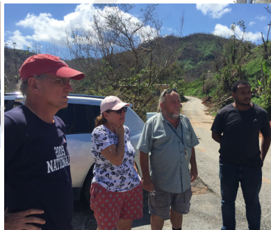
The 2UC Eli Lilly crew delivering bottled water in the Caguas area.