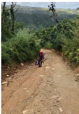
Caguas: It was a long hike up, but the view was worth every step