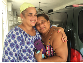
One of our first trips - Toa Alta. A 15 minute trip took us hours as bridges were washed out and roads were closed.