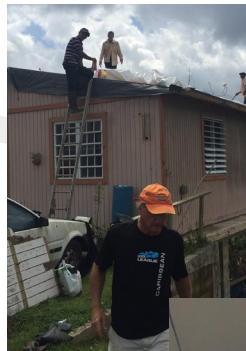
PB in Aguas Buenas