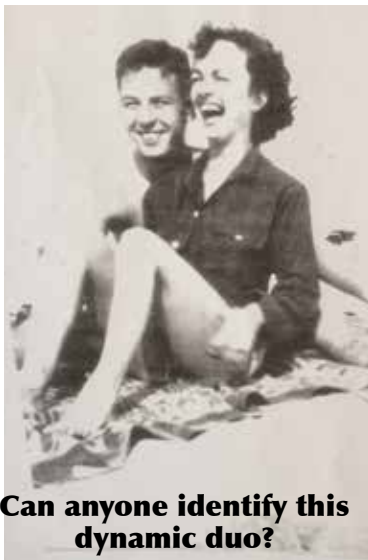
Can anyone identify this dynamic duo?