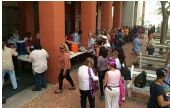
Monday evenings at Plaza Ballajá

The Heart 2 Heart ministry team provides 60-100 meals for the homeless in Old San Juan on every third and fifth Monday - rain or shine!