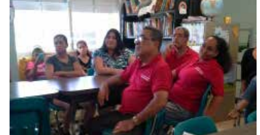
a recent meeting with parents at the Juanillo Fuentes School